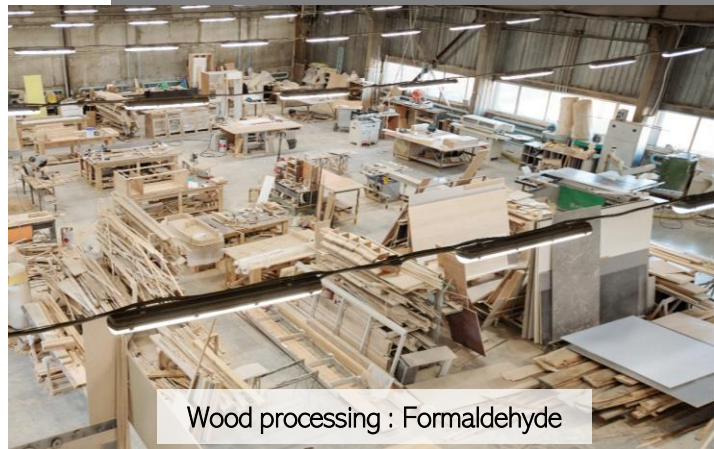
Wood processing : Formaldehyde

The T BIO-GAS filter is an advanced, modular, continuous-cycle air purification system for AHUs or with integrated self-ventilation that can be used in all air-conditioned buildings with the presence of pollutants (VOCs e.g. formaldehyde in buildings with wood and formica processing, ethylene in fruit and vegetable processing).