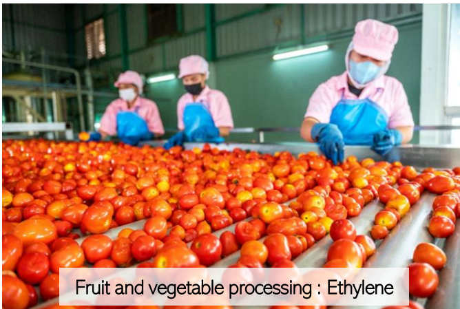
Fruit and vegetable processing : Ethylene

Purified air, certified continuous cycle in industrial buildings