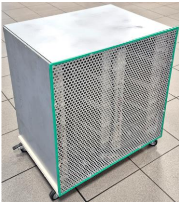
T BIO-GAS filter with autonomous ventilation: trolley version

In order to guarantee the best filtering effect, the length of the T BIO-GAS FILTER is approx. 400 mm so as to obtain contact times between the polluted air and the filter that are more than sufficient for perfect purification and maximum reduction of polluting gases (VOCs).